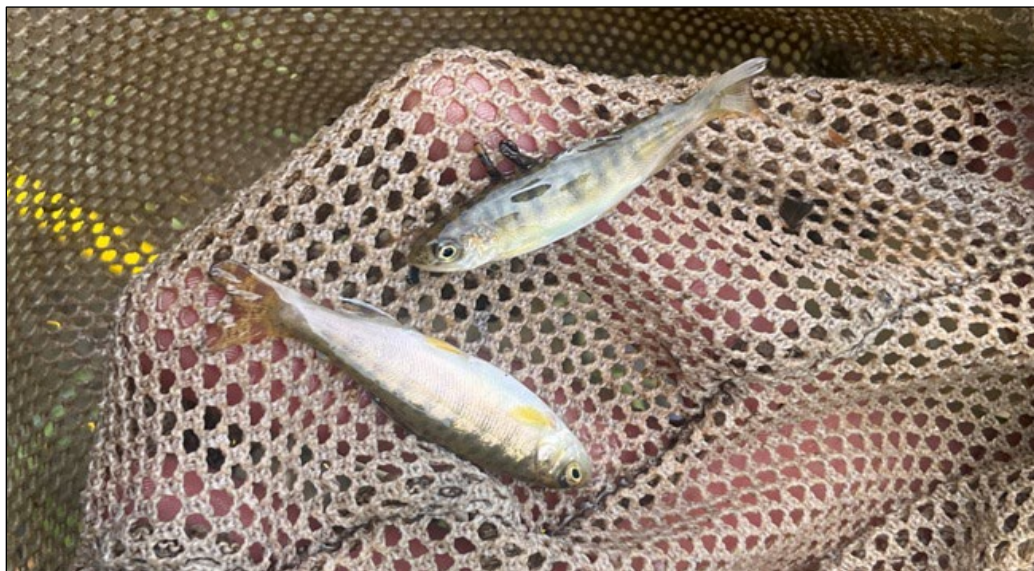
Figure 1.–Juvenile coho caught at waypoint 315.