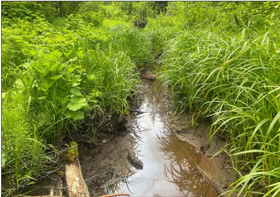
Figure 3.—Downstream at waypoint 315.