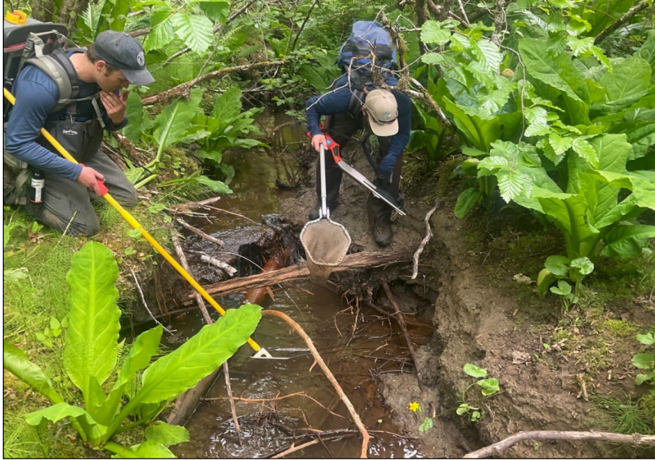
Figure 2.—Head cut, looking upstream at waypoint 316.